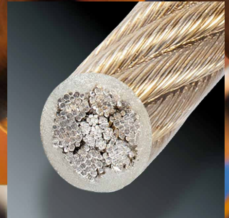
High-strength wire ropes combined with specifically designed polymers revolutionizes the traditional elevator technology.